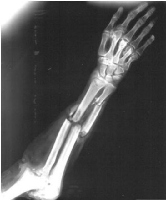
FIG. 1—X-rays of the human forearm recovered from Mount Sanford.