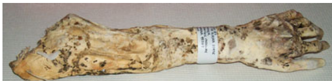
FIG. 2—Embalmed left forearm and hand found on Mount Sanford, Alaska, in 1999.

paternity laboratory for autosomal short tandem repeat (STR) testing. Again, however, the identification efforts were unsuccessful. The DNA extraction from the sample yielded no quantifiable genetic material so DNA testing was not pursued at the time.