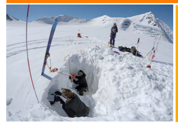
Winter snowfall nourishes the glaciers and icefields each winter, competing with summer melt to determine overall glacier health.