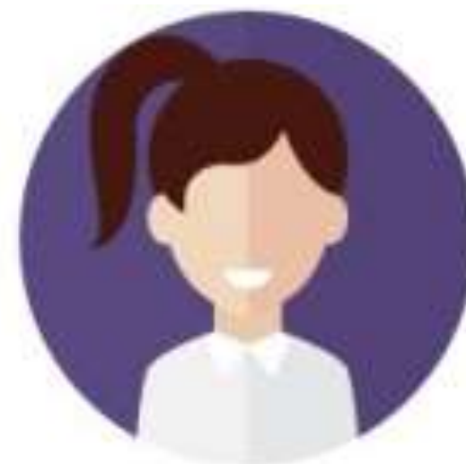
Awards / Post Admin