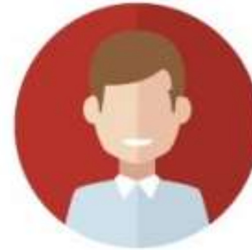
Scholarship Liaison Officers