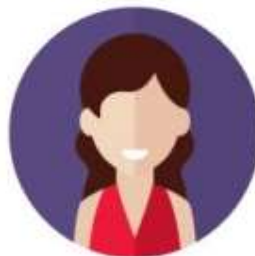
Research Grant Officers