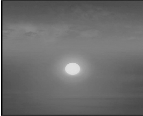
Figure 2. The Meditation Chamber, phase one. Users' continually changing physiological states first affect a setting sun and then a rising moon.