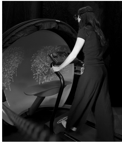
Figure 5. Virtual Meditative Walk

their body schema (Gromala, 2000), which is crucial for meditation. Finally, we are developing easily accessible ways to reinforce and track what users learn in VR through applications developed for computers and mobile devices.