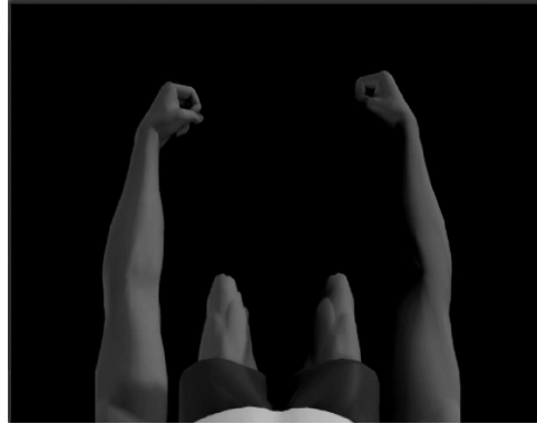
Figure 3. The Meditation Chamber, phase two. A first-person display of the user, male or female, mirrors their actions during the progressive muscle relaxation phase.

The extensive amount of biometric data collected from the SIGGRAPH attendees (Shaw, Gromala & Seay, 2007) was subsequently subjected to analysis. The analysis revealed a distinction between novices (i.e., users who had never meditated or had attempted to do so only a few times) and experts (i.e., those who regularly meditate). Only 25% of users had biometric profiles that fell between the two. This was surprising, since we expected to find a smoother continuum. To use GSR data as an example, just over half of the participants exhibited what can be called a “novice” GSR pattern or profile. This means that their GSR level started relatively high, descended through the first phase of the experience, increased and showed peaks in the muscle relaxation phase, and then began to decline again in the final phase, ending up at or more frequently beneath the low established in the first phase. Breathing patterns in novice profiles tended to be steadier and deeper in the final phase than in the first phase. In the expert profile, precipitous drops in GSR occur during the first phase, entered a very low and often flat GSR state before the muscle relaxation phase began. This flat-line state was typically maintained throughout the remaining two phases, and was accompanied by a very steady but not necessarily deep breathing pattern. Individuals who exhibited the expert GSR profile also showed a very consistent respiration rate and amplitude throughout the experience.