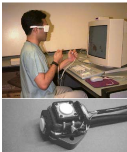
Figure 1: (a) A user using the two-handed stereo interface to SFA.(b) A 3D tracker with buttons attached.