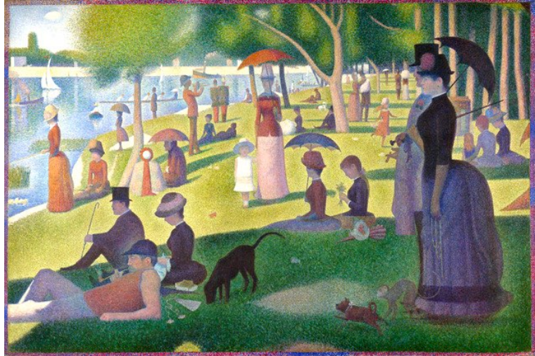
A Sunday Afternoon on the Island of La Grande Jatte by Georges Seurat

He believed that this form of painting would make the colours more brilliant and powerful than standard brushstrokes. 6