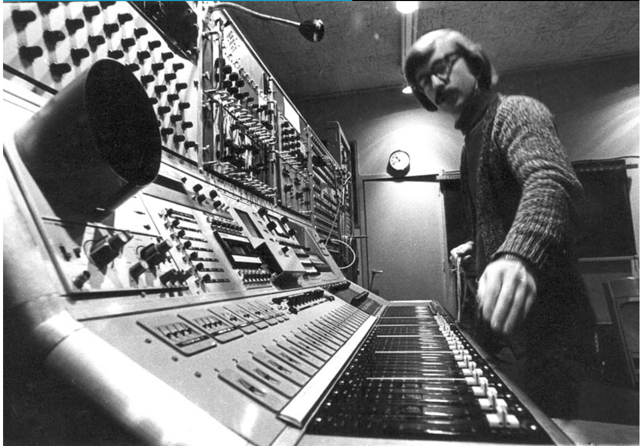
At the Institute of Sonology, Utrecht, 1973