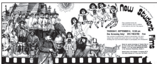
A. 1982/1983 Film Program poster advertising student films.