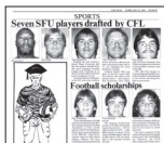
◀ Seven SFU Clansmen were selected in the 1984 CFL draft of university players - the first players from any single university that year. The Peak, February 16, 1984.

SFU's scholarship policy served to develop high-performance athletes and coaches, able to compete in both amateur and professional ranks on the world stage. Proof of this is the number of Olympians and Canadian Football League (CFL) players that SFU has contributed over the years. Beginning with the 1968 Mexico Olympics, some 75 athletes and coaches have competed as Olympians. And over the years a substantial number of SFU footballers have swelled CFL ranks.