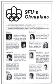
◀ SFU sent an impressive roster of athletes to the 1976 Olympics held in Montreal.