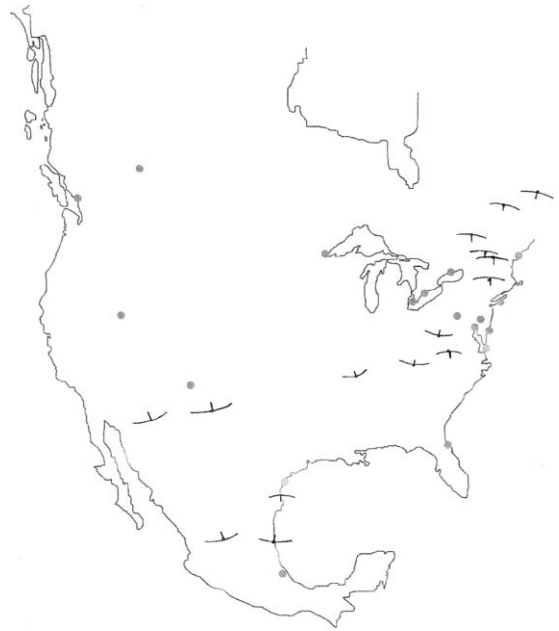
Figure 3. The 1 October migration isophene (i.e., the calculated positions of Peregrine Falcon migrants on 1 October, based on the 50% passage dates). Estimation method described in the text. The arcs indicate positions that peregrines are estimated to have reached on 1 October by traveling in the typical migration direction past the hawkwatch sites studied (Table 1). The line segment on each arc points to its corresponding hawkwatch site, which is located to the north of the arc if October 1 is after the 50% passage date at that site, and to the south if October 1 precedes the 50% passage date. Peregrines at the west coast Fraser estuary site were likely not all long distance migrants, and hence no migration is indicated.

To measure the west-east component of peregrine passage, we estimated the position of the 1 October isophene, which is defined as the position of the migratory front on October 1st (see Byrkjedal and Thompson 1998). We used Fuller et al.'s (1998) estimate of 172 \text{ km d}^{-1} as representative of migration speed, and added or subtracted the expected progression of the observed 50% passage date at each site to 1 October. For example, the 50% passage point occurred in New Mexico (Goshute Mountains) on 23 September, meaning that on 1 October (i.e., 8 d later) it should have progressed southward by 1376 \text{ km} (= 8 \text{ d} \times 172 \text{ km d}^{-1}) . As peregrines move on a broad front, we indicate these calculated positions by arcs of 20^\circ centered on the main direction of migration, which was taken from