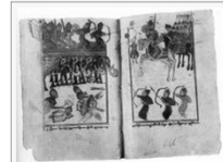
History of Armenia

The single event that started the chain is most likely the Russian victory over the Ottoman Empire in the War of 1877-78. At the end of this war the Russians took control over a large part of Armenian territory (including the city of Kars). The Russians claimed they were the supporters of Christians within the Ottoman Empire and now they were clearly militarily superior to the Ottomans. The weakening control of the Ottoman government over its empire in the following 15 years led many Armenians to believe that they could regain independence from them.