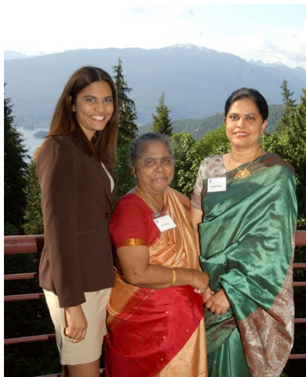
Three generations enjoy the view at the SFU International Graduates' Reception.