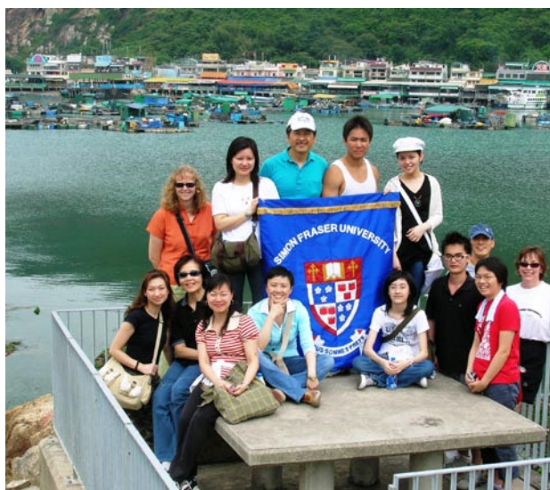
Hong Kong alumni and friends enjoy a day trip to Lamma Island.

SFU's earliest grads gathered in March '07 for a reception at the Vancouver Museum Totems to Turquoise exhibit.