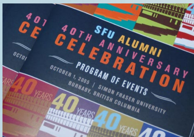
Program for SFU Alumni Association's award-winning 40 th Anniversary Celebration

MBA Alumni Dinner, Ottawa Alumni Breakfast, Outstanding Alumni Awards, Alumni Leaders Forum, Charter Reception