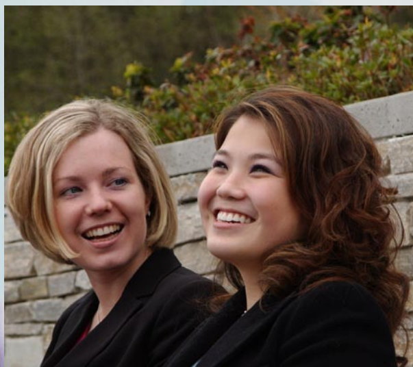
Students relaxing in the Cornerstone plaza at UniverCity.

Thanks to the generosity of 7,689 alumni donors, support for SFU students reached new heights in 2006/07. The Alumni Scholarship & Bursary Endowment grew 10% to $3,597,000, providing $175,000 annually in student financial aid. The Alumni Library Endowment grew 8% to $1,998,000, contributing $95,000 a year for library books and resources. Matching funds from the Alumni Association helped grow monthly giving to $60,000 annually. 100% of alumni gifts go directly to benefit students. Simply put, alumni donors open up a world of opportunity for students, and we thank you.