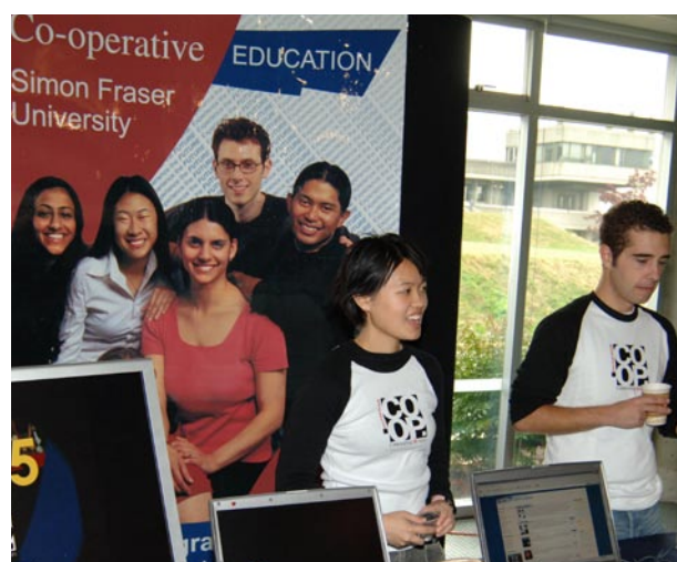
Students at SFU's 40 th Anniversary help mark 30 years of co-op education.