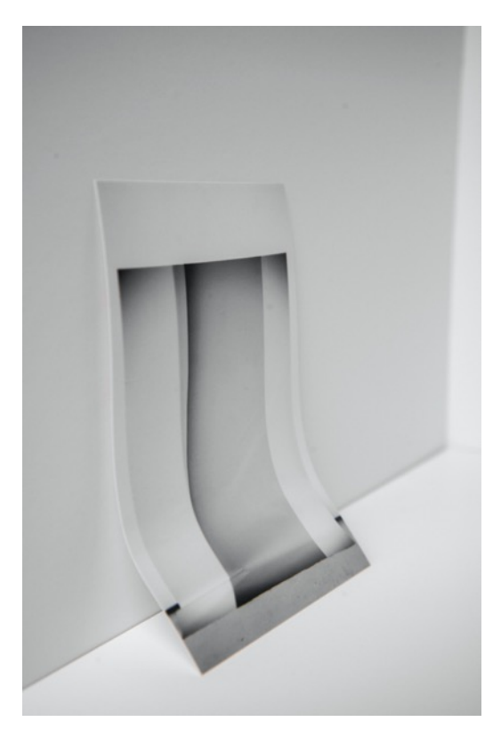
Rebecca Howard, from Folding series (2019-present day), digital prints, 1189 x 841mm