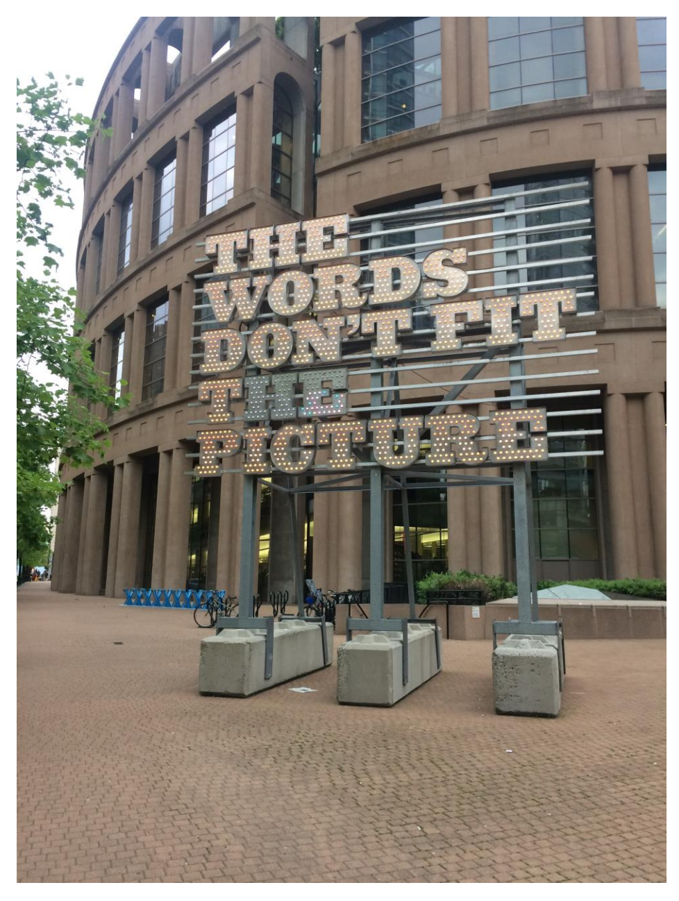
1 - "The words don't fit the picture" public art at the Vancouver Public Library. Photo taken by instructor.