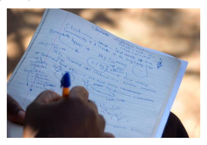
1 - The self+peer reflection will look like this:

I will also ask you to complete a self- and peer-reflection , which should indicate the effectiveness of the group work, the duties of each group member, the frequency of meetings, and how you would grade each student (including yourself) for their effort and work contributed.