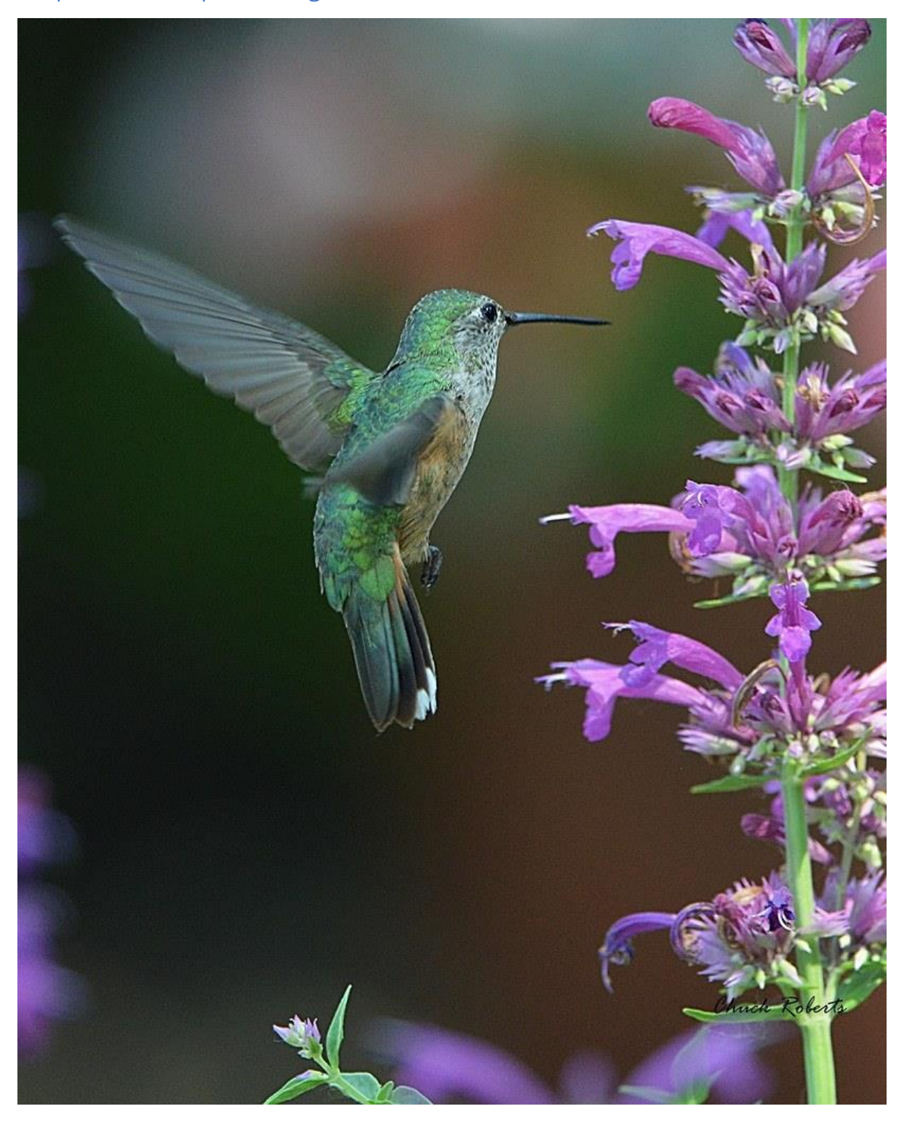
Step 4. Put the pieces together.