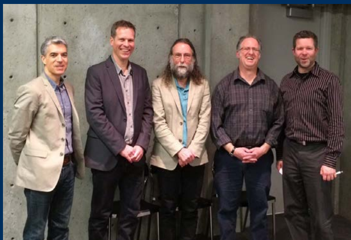
IdeaFest 2015 | Canada's war against ISIS - panel members