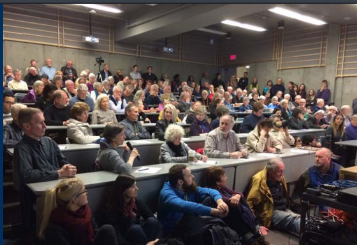
IdeaFest 2015 | Canada's war against ISIS - a full house