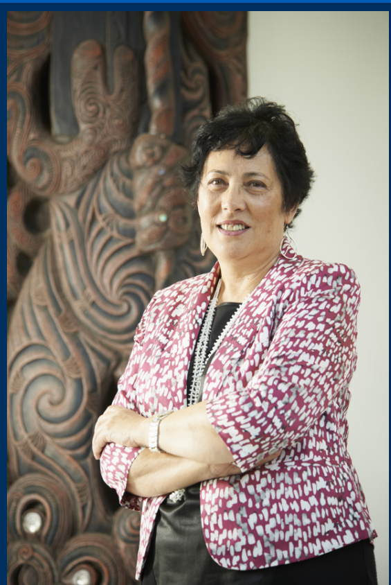
Professor Linda Tuhiwai Smith