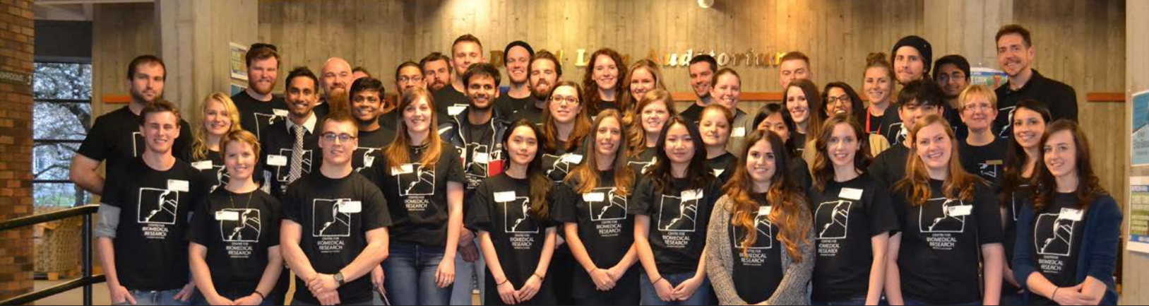
Centre for Biomedical Research students