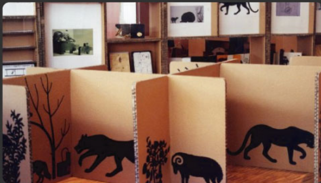
First work: Wodden Children Puzzle