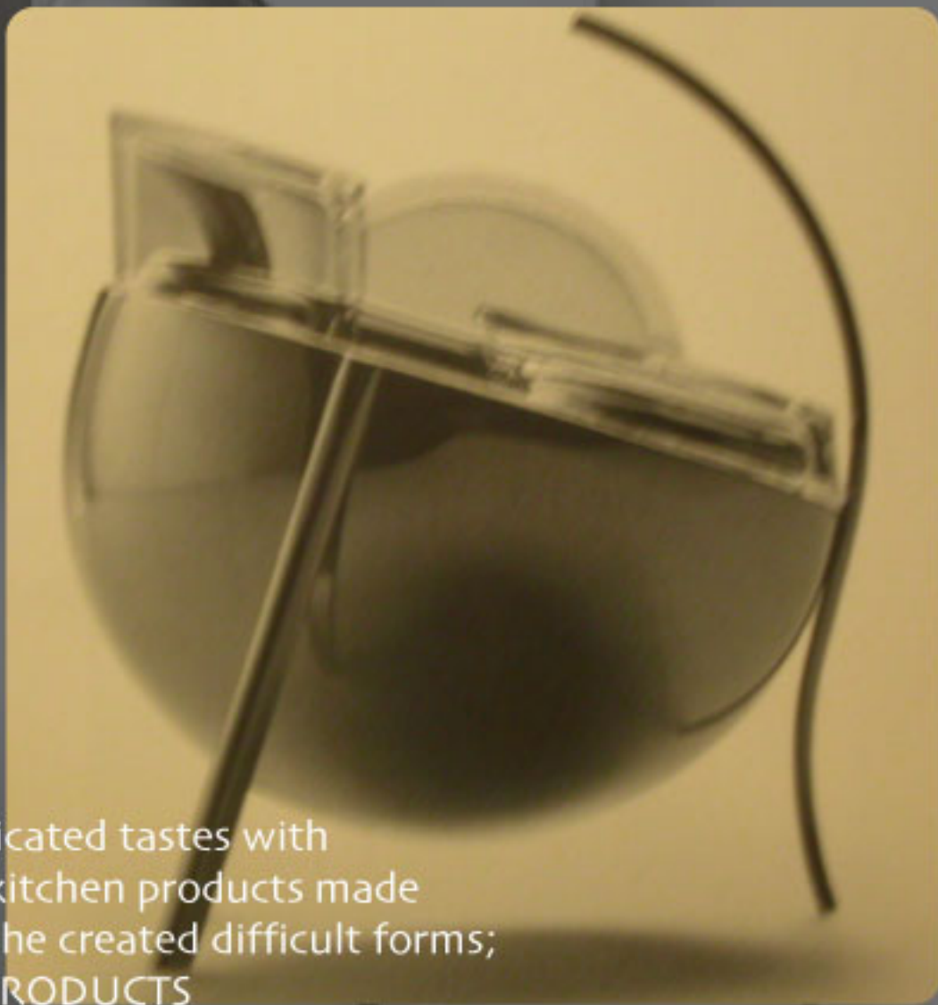
Copernico set of pots

I cannot help but wonder what I did I do wrong. If everyone likes it it means that I have affirmed reality as it exists, which is precisely what I do not want.