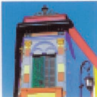
Picture created at a low resolution of 72 dpi will cause the image to be jaggy and not crisp.

All file formats must have a minimum of 350 dpi (dot per inch) resolution. The images designed for the web are done at a low screen resolution of 72 dpi. Print images need to be created at 350 dpi or there will be a substantial drop in the image quality.