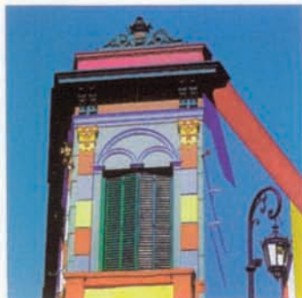
Picture created and printed at a high resolution of 350 dpi.