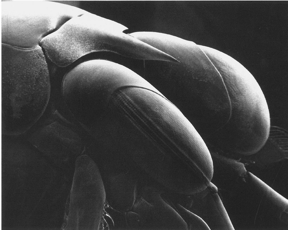
Figure 1. The anterior end of an adult mantis shrimp, Neogonodactylus oerstedii , imaged by scanning electron microscopy. This species is found throughout the Caribbean, living in coral rock and coralline algae. The visual regions of the compound eyes, revealed here by the densely packed facets (each of which represents the cornea of a single ommatidium), lie at the ends of stalks that pivot at their proximal ends. Each compound eye consists of two flattened hemispheres separated by six parallel rows of ommatidia, called the midband. Magnification: approx. 30 \times .

Figure 2 is a diagram of a typical ommatidium from the hemispherical regions of the eye outside the midband. The top half of this structure, including the refracting cornea and the underlying crystalline cone, is devoted to optics, focusing light on the top of the photosensitive structure, called the rhabdom. This rhabdom is constructed from eight receptor cells formed into a single light guide. It consists of a small upper tier, produced by receptor cell number 8 (R8), and a much longer underlying tier formed by contributions from receptor cells numbered 1 to 7 (R1–7). R8 is sensitive only to ultraviolet light (Cronin et al. , 1994b; Marshall and Oberwinkler, 1999), but the fused receptor produced by R1–7 is sensitive to middle-wavelength light, near 500 nm (see Cronin and Marshall, 1989a, b). The R8 receptor is polarization-insensitive, as its microvilli are not all parallel, but the two sets of receptors in the main rhabdom have orthogonal microvilli and are very sensitive to the plane of polarization (see also Marshall, 1988; Marshall et al. , 1991a). Axons from these two receptor sets converge onto higher order interneurons (Horwood and Marshall, unpubl. obs.), which could explain how polarization opponency arises in mantis shrimp vision (see Yamaguchi et al. , 1976).