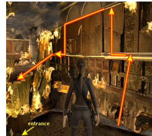
Fig. 2. Obstacle 3 [21]