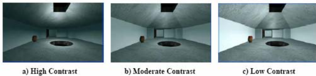
Figure 4. Linearly increasing brightness contrast (where center of room is the focus)

Two prototypes were created for this system. The first prototype was developed to test the representation of patterns and their integration within ELE. For this purpose, the author created an interactive 3D environment using WildTangent, a publicly available web-based game engine; the environment is shown in figure 4. The task of the user was to navigate through the environment. The lighting conditions were varied as a function of time. The figure shows three screenshots taken at various times during the interaction. The lighting system was configured to use pattern IX, where brightness contrast subjected was decreased as a function of time (where brightness contrast is measured in terms of difference between bright and dark spots in an image). As the figure shows, visibility was well balanced with the contrast effect, as contrast increases or decreases in time.