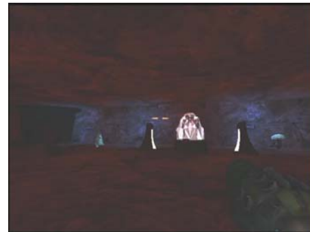
Figure 6. Warm/Cool Color Contrast

During game play, the author increased or decreased tension based on danger. A danger value was defined as a function of health and number of enemies within the environment. The author used a combination of patterns I and III, where increase in tension was projected as an increase in warmth and saturation of surrounding lights. Thus, if the user is confronted with many monsters and his health is dropping over time, the warmth and saturation of color will increase over time showing an increase in tension. While if the player is killing monsters and danger level is