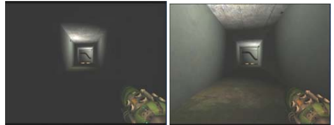
Figure 5. Varying Brightness Contrast

Using this implementation within Unreal, a first person shooter mod was developed. The lighting compositions varied within the level composed. For example, in the beginning a decrease of brightness contrast was established through the opening scene, shown in figure 5. At the end, a warm/cool color contrast as well as brightness contrast was used, as shown in figure 6.