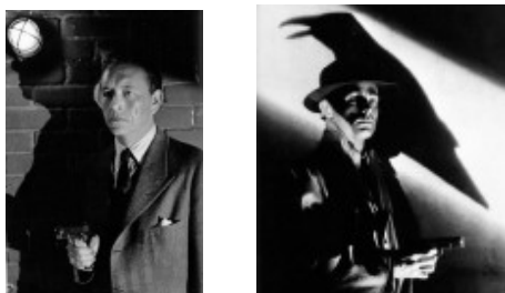
Figure 2. Film Noir uses contrasts and shadows

In addition to color and brightness contrast, filmmakers also used affinity of color, e.g. affinity of high saturated warm colors or unsaturated cold colors in one shot [4-11]. An example movie that extensively used this technique is The Cook, the thief, his wife, and her lover . Other examples include The English Patient , which used affinity of de-saturated colors, and Equilibrium , which used affinity of cold unsaturated colors.