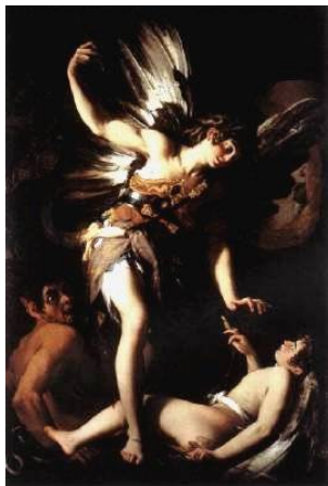
Figure 1. Chiaroscuro Technique used in Sacred love versus profane love Painting

These kinds of patterns are usually used in peak moments within a movie, such as turning points. Lower contrast compositions often precede these heightened shots, thus developing another form of contrast, contrast between shots.