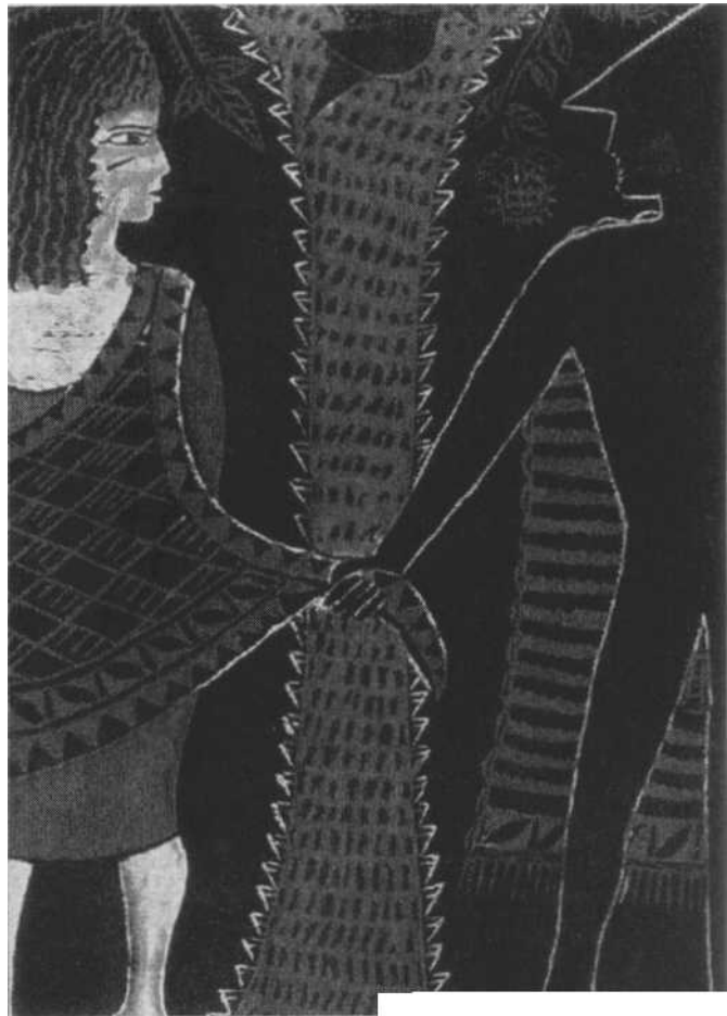
Roche/le Rubinstein, %n the Garden, "hand-co/cured /inocut print 1995

In contrast, lawsuits (in a legal system which is public) would permit citizens to see the documents, to know what position the government is arguing, and possibly, to intervene. The press can cover trials, and MPs and ministers can be held to account. The secret dispute panels used