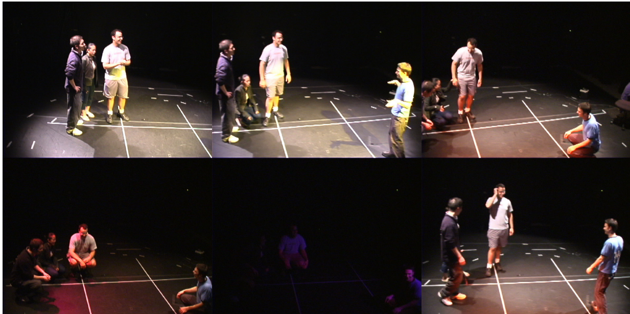
Figure 2. Scenes from the final participatory design workshop in which the relationship between body states and word puzzles were explored. The system utilized is an early prototype with the substantive functions implemented. As players lower themselves, the environment becomes progressively darker and the ambient audio more pronounced. Note: the display response is not the same as depicted in the scenario. In this exercise, the goal was to create darkness rather than light.