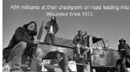
AIM militants at their checkpoint on road leading into Wounded Knee 1973.