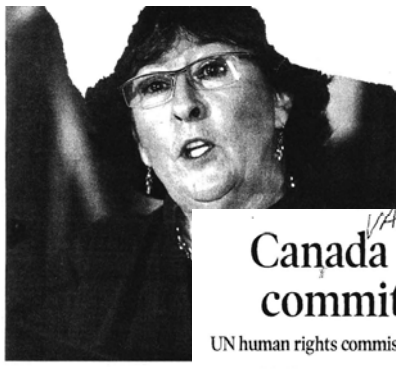
Canada's Louise Arbour, UN high commissioner for human rights