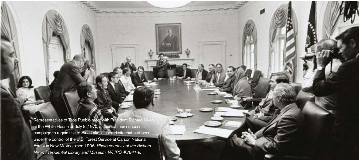
Representatives of Taos Pueblo meet with President Richard Nixon at the White House on July 8, 1970, as part of their successful campaign to regain title to Blue Lake, a sacred site that had been under the control of the U.S. Forest Service at Carson National Forest in New Mexico since 1906.

The NCAI boasted many successes, including its lobbying campaign to reverse the federal government’s “termination” policy of ending nation-to-nation relations with tribes.