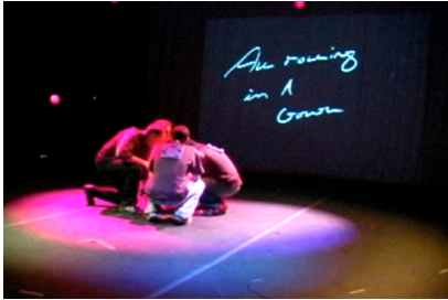
Figure 1. Participants playing socio-ec(h)o

We believe that gradient responses can provide this type of feedback. We have developed an audio display schema, and experimented with gradient response and intensities in the audio display in order to confirm and anticipate users' actions.