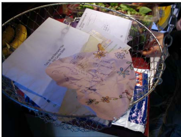
Figure 7 The hanging basket is used to place lists that are visible to both Lori and Abe

In summary, we have described an implicit, even unconscious sense that a system is working. This is characterized by our 1+1=3 pattern in which the full complexity of the system is not consciously understood,