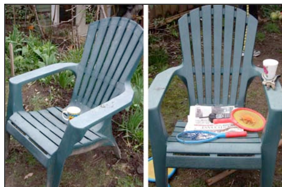
Figure 2 Two lawn chairs used as temporary garden tables

The examples above are simple actions of appropriating artifacts by discovering and exploiting the affordances, such as the flat surfaces of the chairs, or container qualities of the measuring cup.