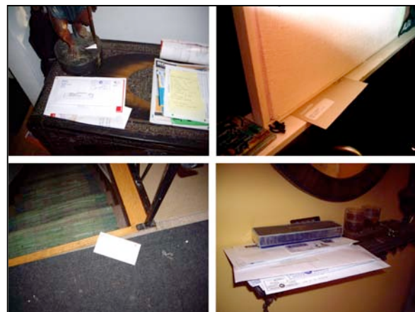
Figure 4 From the left corner clockwise: the chest to the right of the door for Paul's and non-urgent mail; a letter on top of the half-height wall for the tenant; mail at the top of the stairs for the tenant; important mail on the decorative shelf to the left

Cate later told us that she sorted her mail in a similar way in