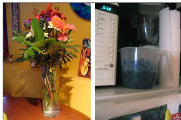
Figure 1 A measuring cup is used to temporarily hold marbles to free up a vase. The marbles and measuring cup are placed visibly atop the fridge to serve as a later reminder to find a better place for the marbles

One session in Lori's home occurred a day after her birthday. Lori is a part-time primary school teacher, who lives with her five-year-old son and during the time of our study, a live in partner named Abe. During the ethnography session Lori received a bouquet of flowers from her friends. She looked in the kitchen cupboards for a vase. She pulled out a measuring cup and a vase that contained marbles. She