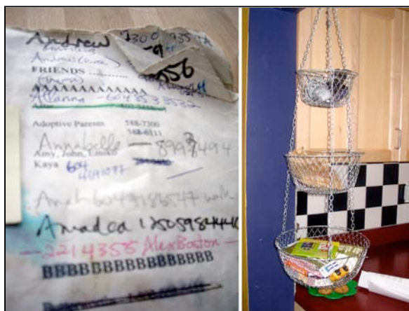
Figure 8 Two examples of design-in-use: on the left is the home-made family phonebook made to be pliable, and on the right is Lori's hanging basket as a cocoon pattern

What becomes apparent is that the ongoing dynamics and pressures on everyday design actions shape routines and systems into a level of uniqueness that is finely tuned to the