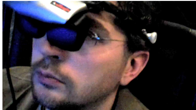
figure 1. Immesant Meditating in the Meditation Chamber

application for chronic pain. To that end, a major focus of our group has been on the development of VR treatments that build on and integrate what we already know can be effective for the management of chronic pain. One line of research is the investigation of the utility of VR-based biofeedback and meditative practices, since these interventions have consistently been shown effective for improving major aspects of functioning in sufferers of chronic pain (e.g., [6]). In their Meditation Chamber, Shaw, Gromala, and colleagues [9,10] demonstrated that biofeedback and VR can be effectively combined to accelerate the adoption of a meditative practice. More specifically, they showed that VR can enhance a user's ability to enter a meditative state and to effectively use biofeedback. Based on that foundational work, we are now creating a VR-based therapy for chronic pain that incorporates a unique virtual environment (VE) with biofeedback and meditation.