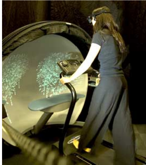
figure 4. The Virtual Meditative Walk