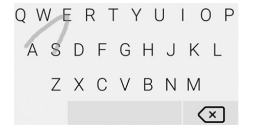
Figure 4: The gesture trajectory of the word "sea" passes the keys "s". "e", "w", and "a" so our system converts the x,y representation of the trajectory into a series of "s", followed by a series of "e", a series of "w", and then a series of "a".

issue is that like many other massively trained language models, BERT was designed to handle language tokens as input, whereas, the input data from PhraseSwipe is touch point from Euclidean space. Our approach to this problem is to use an ordered sequence of English characters instead of integer coordinates as input for the language model. When a user enters a gesture, our system converts the x and y coordinates of the gesture trajectory into a series of nearest keys on the keyboard, represented by an ordered sequence of characters. All 26 characters are set as special tokens to the tokenizer and the encoder of BERT, meaning that each character in the input sequence is an individual special token input to the model. In the example shown in Figure 4, the gesture for the word "sea" was translated into a series of "s", followed by a series of "e", a series of "w", and then a series of "a". The number of each letter that appears in this representation is determined by the number of touch points sampled inside the corresponding key as well as the speed, at which, a gesture is drawn at a certain time and location. Note that a significant advantage of using letter sequences is that letter sequences are independent of keyboard size and ratio. Therefore, our decoder works on any smartphone keyboard.