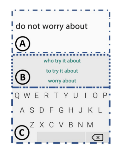
Figure 2: The PhraseSwipe interface is composed of (a) a text field; (b) a list of candidates; and (c) a QWERTY keyboard supporting phrase gesture input.

Editing is needed when an error occurs or when the committed text needs to be revised. With our implementation, the users can first select a target word or multiple adjacent ones and then draw the gesture of a new word to replace the selected one(s). As an attempt to save the users' time from drawing a new gesture, we implemented an auto-correction feature, with which, the system provides the users with a list of candidate words that are similar