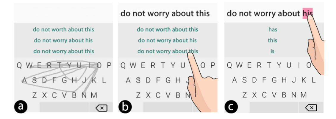
Figure 3: (a) – (b) After a phrase gesture is entered by the user, they can tap one of the items in the candidate list to commit the input text. (c) Auto-correction candidates appear if the user selects a word in the committed text.