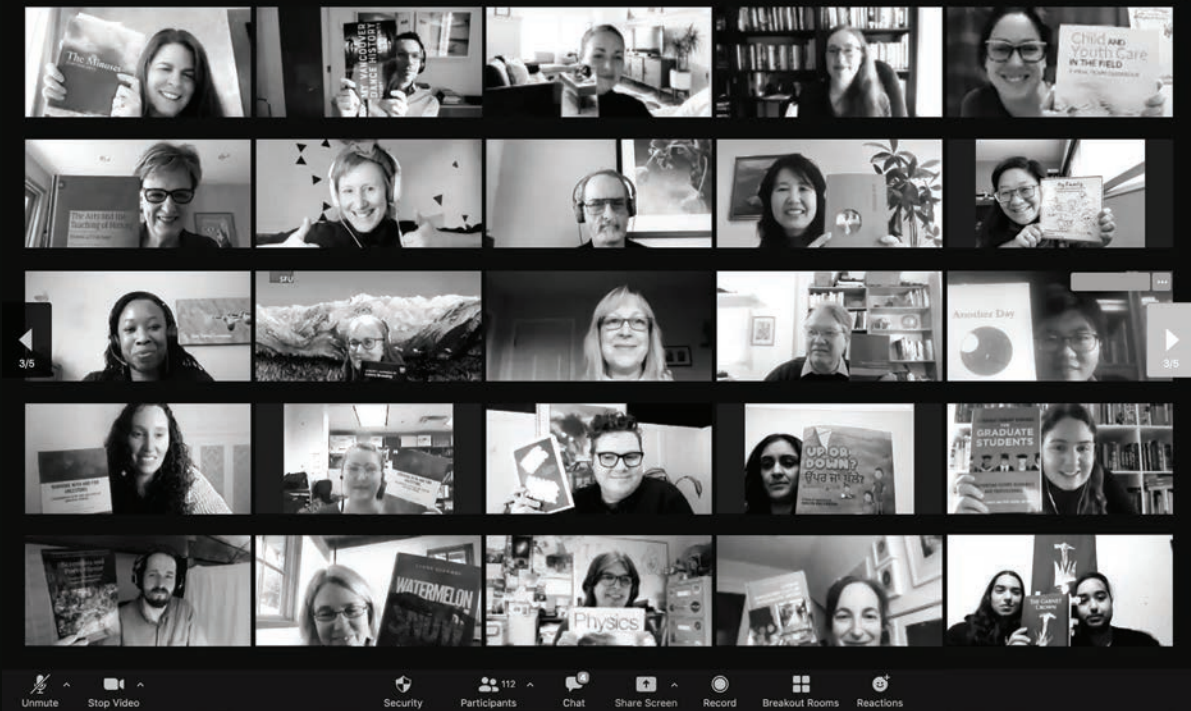
SFU students, faculty, staff, alumni, and friends joined us for a virtual Celebration of SFU Authors, February 2021.

W.A.C. Bennett Library is located on the lands of the xʷməθkʷəy̓əm (Musqueam), Skwxwú7mesh (Squamish), səliłwətaʔ (Tsleil-Waututh), and kwikwəłəm (Kwkwetlem) Nations.