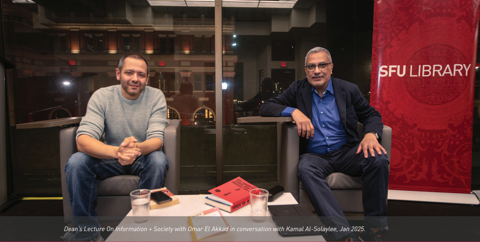
Dean's Lecture On Information + Society with Omar El Akkad in conversation with Kamal Al-Solaylee, Jan 2025.

W.A.C. Bennett Library is located on the lands of the xʷməθkʷəy̓əm (Musqueam), Skwxwú7mesh (Squamish), səliłwətaʔ (Tsleil-Waututh), and kʷikwəłəm (Kwikwetlem) Nations.