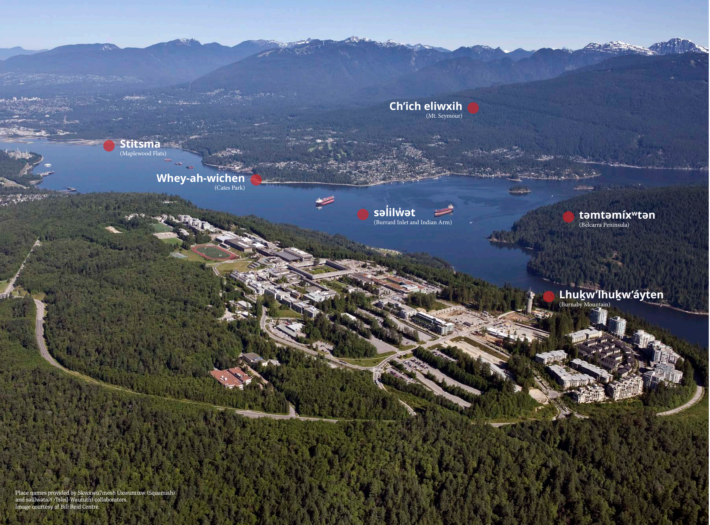
Place names provided by Skwxwú7mesh Úxwumixw (Squamish) and səliłwətəʔ (Tsleil-Waututh) collaborators.