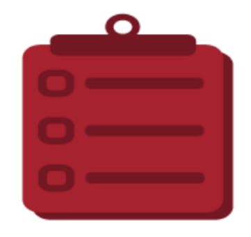
End of Term Check-in and Evaluation