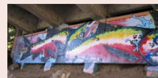
Salmon graffiti by Justin Kaczmarek

These are some salmon works of art in Nanaimo that you can check out (and others—search “salmon” in the inventory ) when attending the SEP Community Workshop.