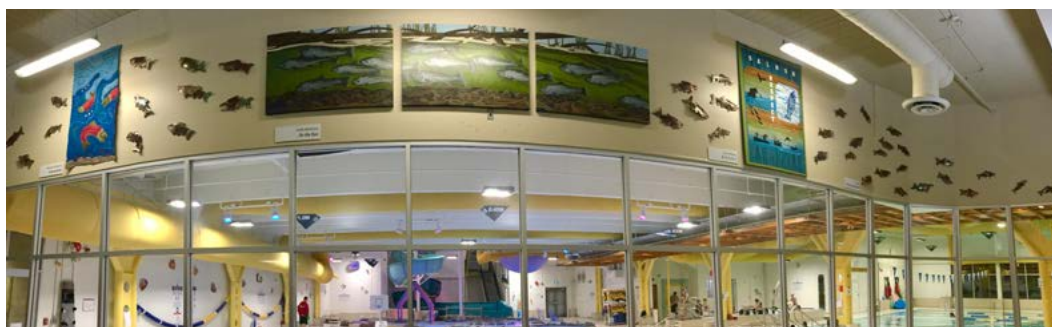
Salmonid and Habitat Health Through Art exhibit in the viewing area of the Sam Ketcham Pool