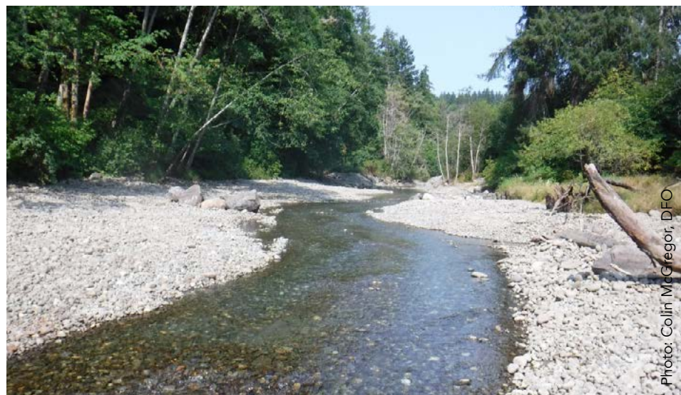
Second Island side channel following 2018 works