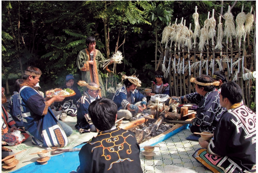
Ainu Ceremony on Hokkaido University grounds.

The Ainu are the Indigenous people of Hokkaido and Sakhalin Island (now Russia). Subject to 150 years of Japanese rule, the colonial history of the Ainu is very similar to that of the Indigenous peoples of North America and Australia. Remarkably, however, they received official recognition as Japan's Indigenous population only in 2008. The Japanese government is beginning to direct resources to develop Ainu-oriented education and research initiatives, such as CAIS, as well as to fund archaeological re-