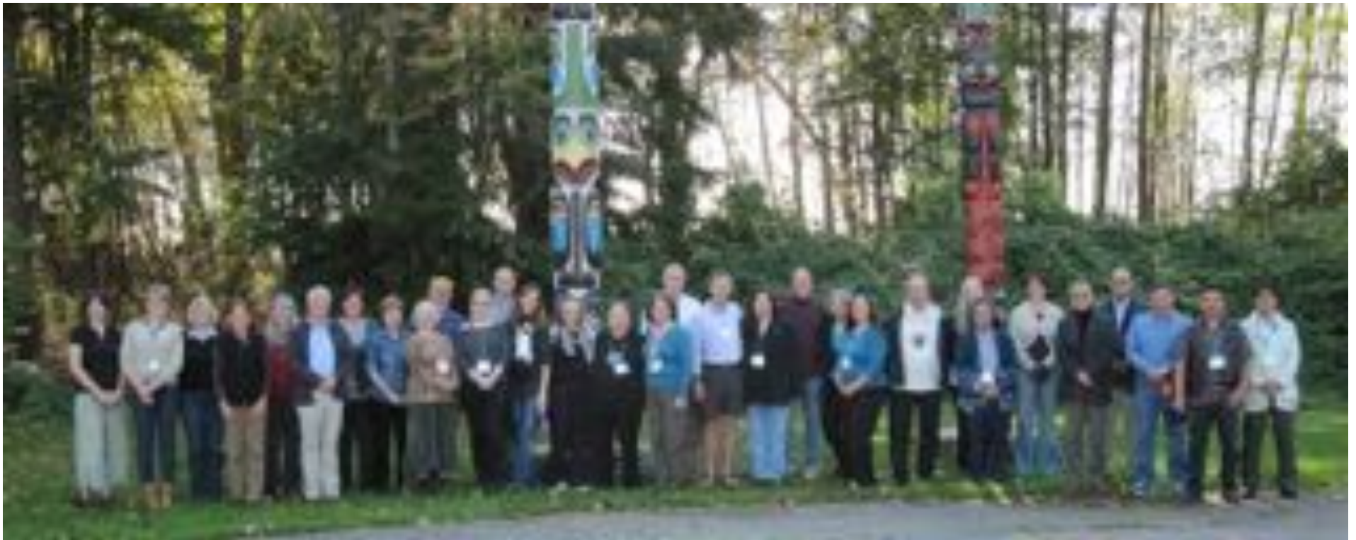
IPinCH Community Based Heritage Research Workshop, October 2010