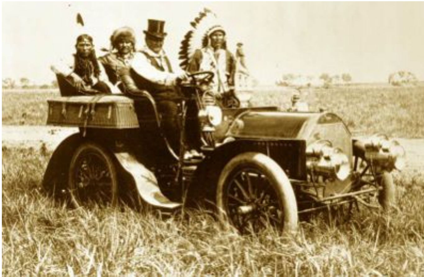
Geronimo in his Cadillac, 1905