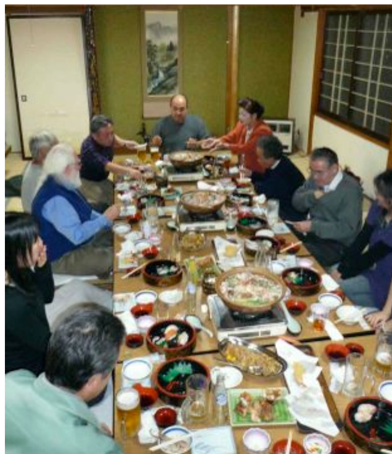
IPinCH - Nibutani Village Meeting, Hokkaido, January 2011