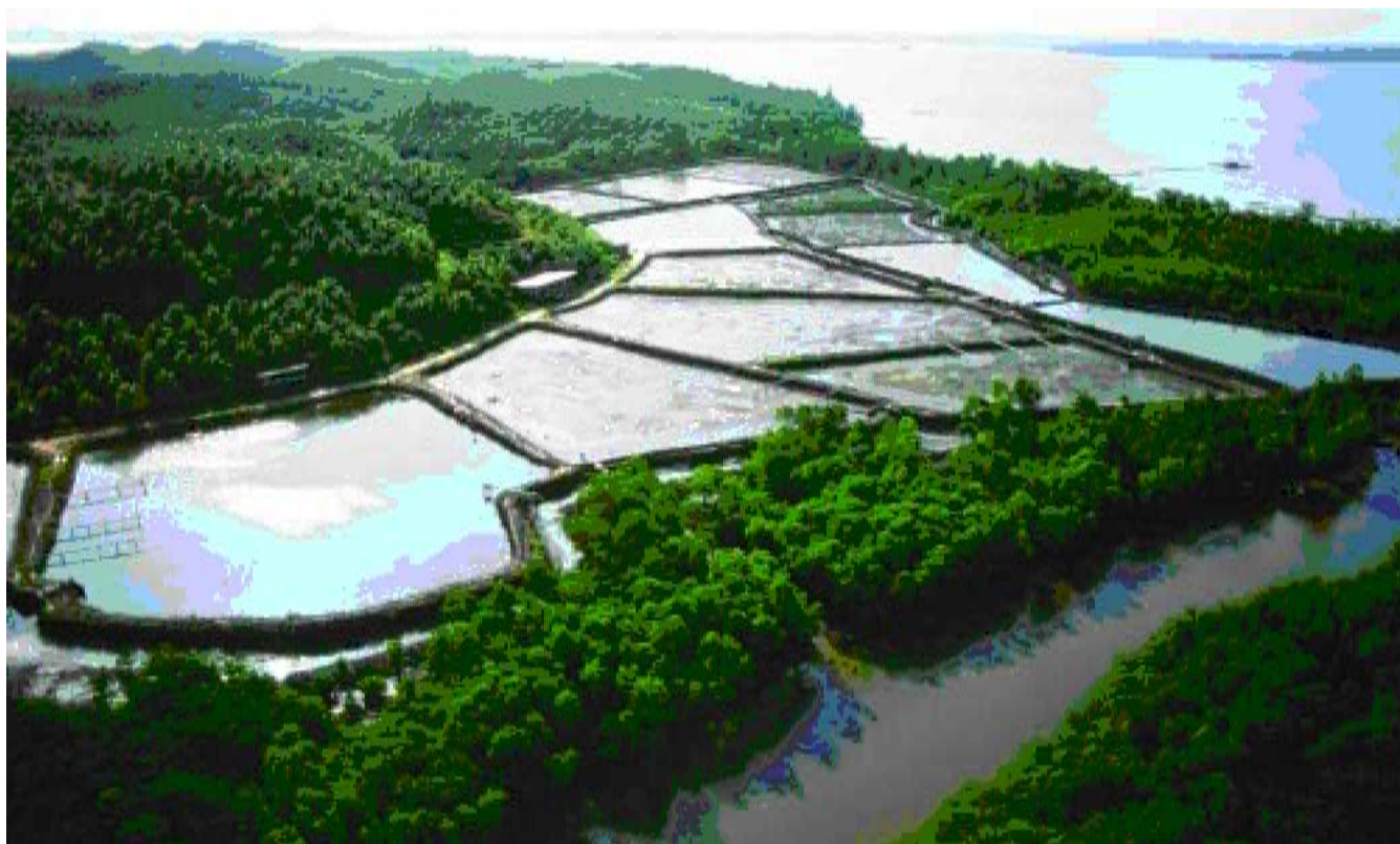
Figure 3. Oblique aerial view of a mangrove forest in Borneo, showing dikes and enclosed shrimp ponds carved out of the mangrove habitat.