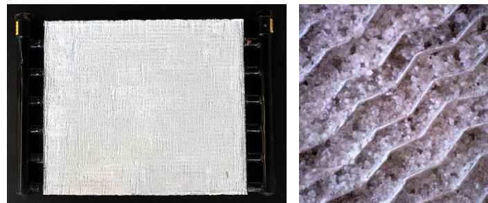
Fig. 1: Heat exchanger loaded with \text{CaCl}_2 -silica gel and binder and closer view of the composite and heat exchanger fins (centre).

A commercially available heat exchanger (engine oil cooler #1268, Hayden Automotive) was filled with 1.3 kg of sorbent with a composition of 30% \text{CaCl}_2 , 55% silica gel (SilicaFLASH B150), and 15% PVA binder (Fig.1). The surface area, volume and weight of the finned tube heat exchanger (painted copper tubes, aluminum fins) were 2.8 \text{m}^2 , 4.1 L, and 2.54 kg. The aqueous salt and binder solution was added to silica gel to create a thick slurry that was pressed into the heat exchanger. After overnight oven drying at 80 °C and curing at 150 °C, more of the composite mix was pressed into the opposite side of the heat exchanger to fill voids, and the sorbent was again oven dried and cured. The sorbent was tested in our lab-scale chiller, described by Sharafian et al. [14] with upgrades to valves and piping. The lab-scale chiller (Fig. 2) has two sorber beds